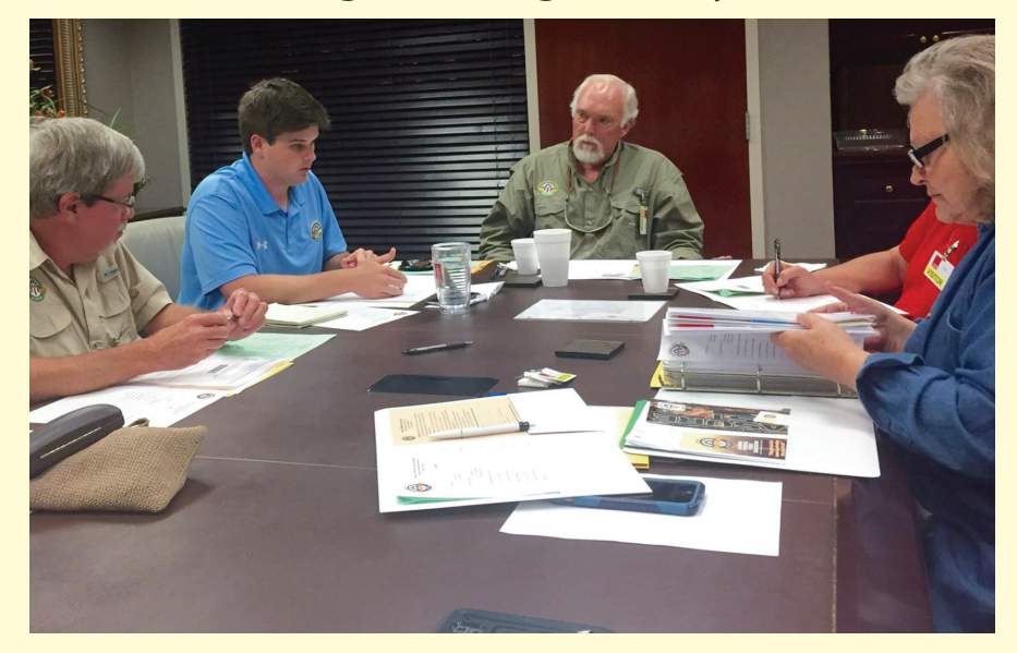
The ATFA Executive Committee was hard at work in April preparing for regional meetings and planning for the annual meeting this fall. The committee also readied for the certification subcommittee meeting, the May board meeting and other business.